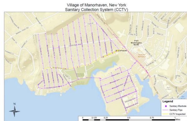
Figure 1-2: Ongoing CCTV Sewer System Evaluation/GIS Database

This GIS inventory could also be expanded to include other municipal systems – such as water and sewer systems, street lights, natural resources and transportation infrastructure (i.e., road condition database). Such a database could function as an important tool in managing future capital and maintenance needs. It would also interface well with several of the Village’s ongoing capital projects (i.e., sewer system analysis and road conditions analysis) – allowing for real-time field updates and integration with Computer-Aided Design (CAD) files. This type of database is extremely valuable as it provides the framework for more advanced design analyses, such as the use stormwater or sewer system modeling software. A functional GIS database would also allow the Village to quickly assess the impact of Town, County, State and Federal regulations/activities on the local community.