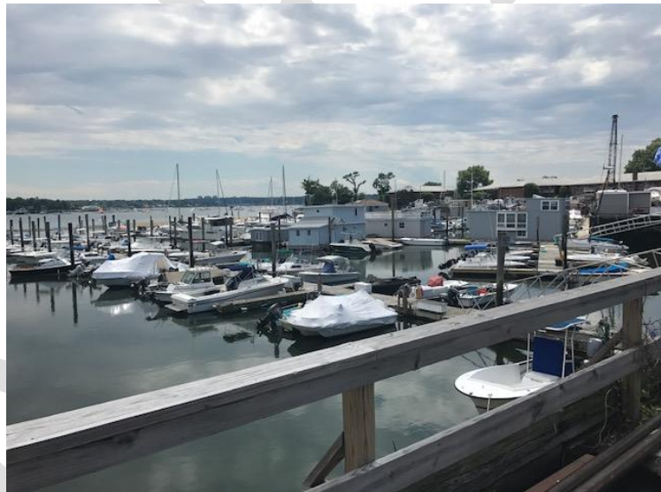
Manorhaven Waterfront off of Orchard Beach Boulevard

Cameron Engineering and Associates, LLP was retained by the Village to assess existing conditions including proposed private developments, attend Waterfront Advisory Committee meetings to understand issues, goals, needs and opportunities, provide examples of code modifications that focus on public access/preservation of open space, and obtain additional input from a public, open-house event. The