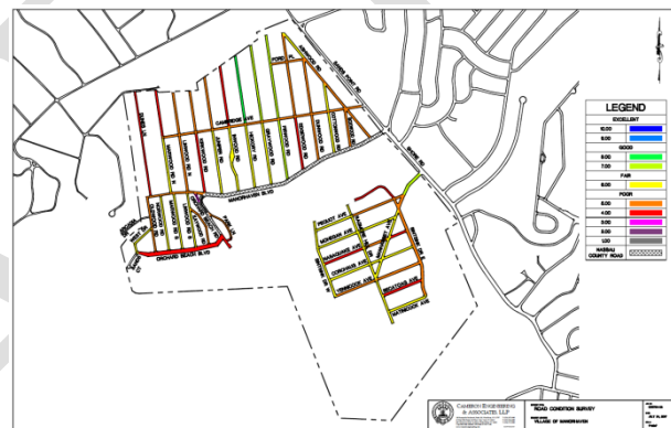
Figure 1-3: Ongoing Road Evaluation Survey/CAD-GIS Database