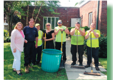
DPW's Project Clean Sweep

Remembering 9/11... Please join us as we commemorate