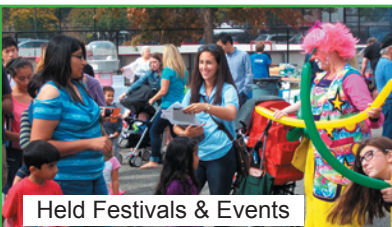
Held Festivals & Events