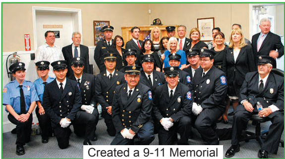
Created a 9-11 Memorial