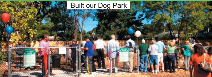
Built our Dog Park