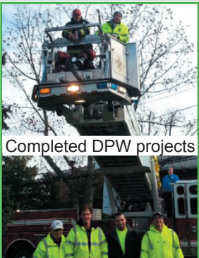
Completed DPW projects