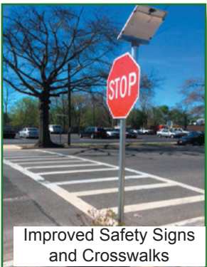
Improved Safety Signs and Crosswalks