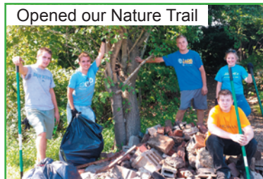
Opened our Nature Trail