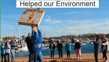
Helped our Environment