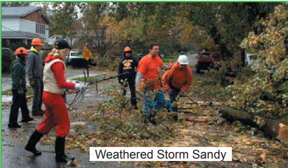
Weathered Storm Sandy