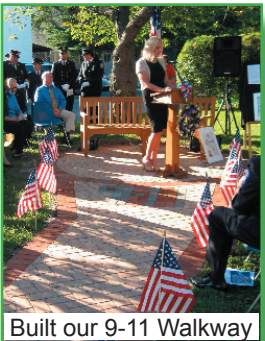
Built our 9-11 Walkway