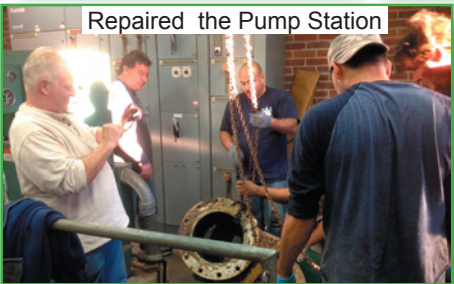
Repaired the Pump Station