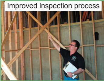
Improved inspection process