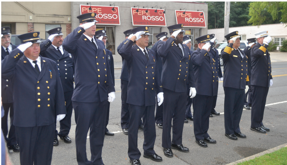
Over a dozen uniformed Port Washington Fire Department volunteers attended the ceremony. They also led the veterans' salute protocol, which included members of the American Legion, U.S. Marines and Veterans of Foreign War.