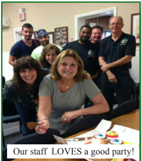
Our staff LOVES a good party!