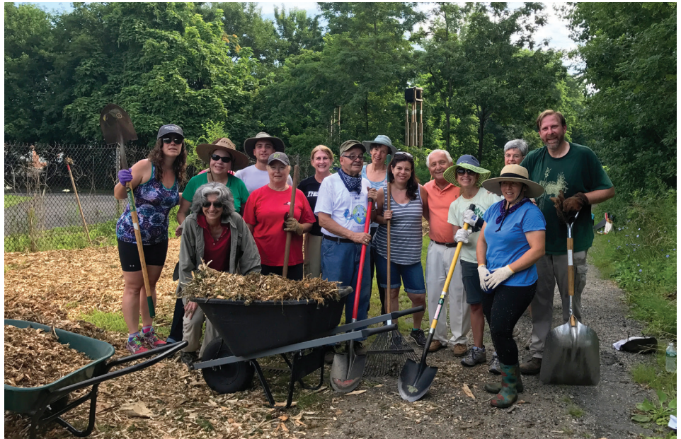
Long Island Native Plant Garden committee members and other volunteers spent a hot day last summer getting all the plants in.

We're pleased to report that the dog park is being renovated to include more seating, smooth tumbled stone instead of wood chips corrected the fence issues to protect smaller dogs, and a water fountain to fill dog bowls. The Village is also working on lighting and other electricity throughout the Preserve.